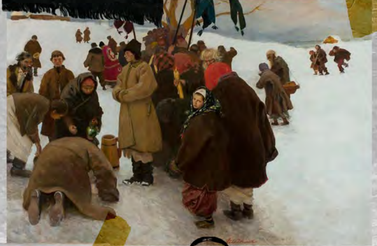
Teodor Axentowicz „Swieto Jordanu”