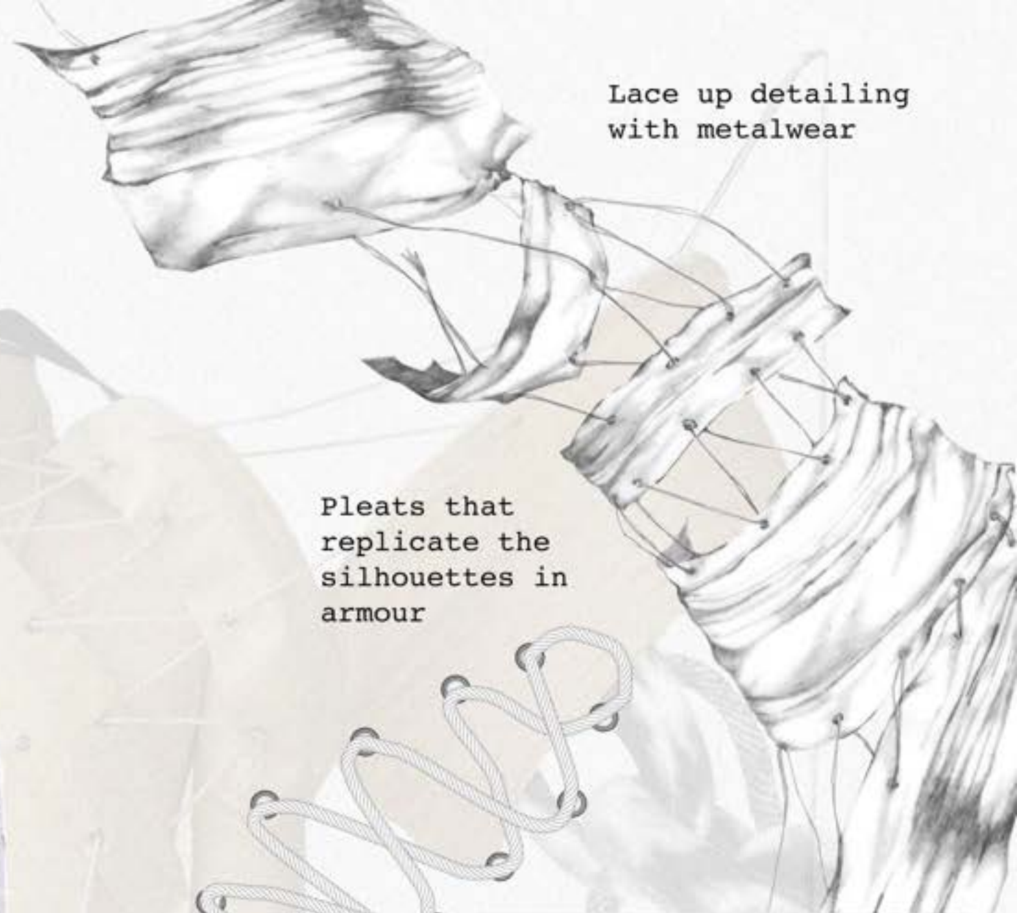
Lace up detailing with metalwear