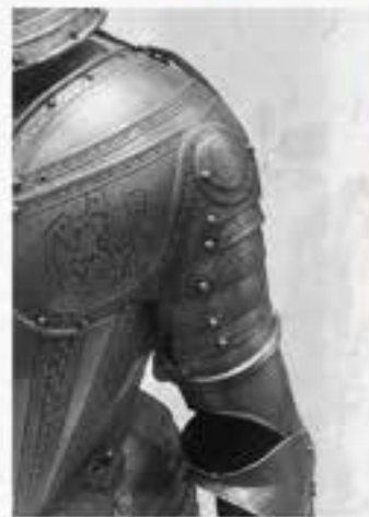
Combining military draping with armour experiments