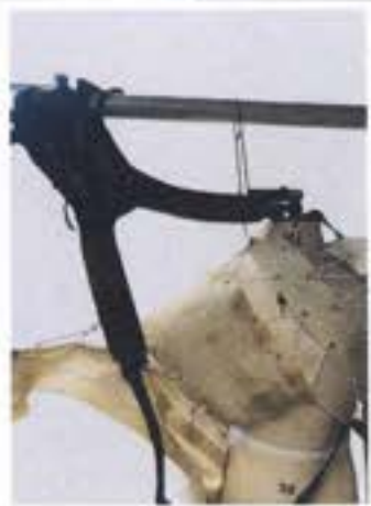
Experimenting with armour shapes and draping for silhouette inspiration