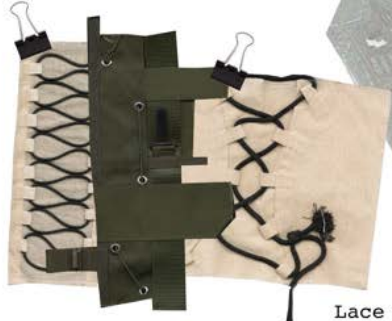
Lace up detailing and metalwear for durability