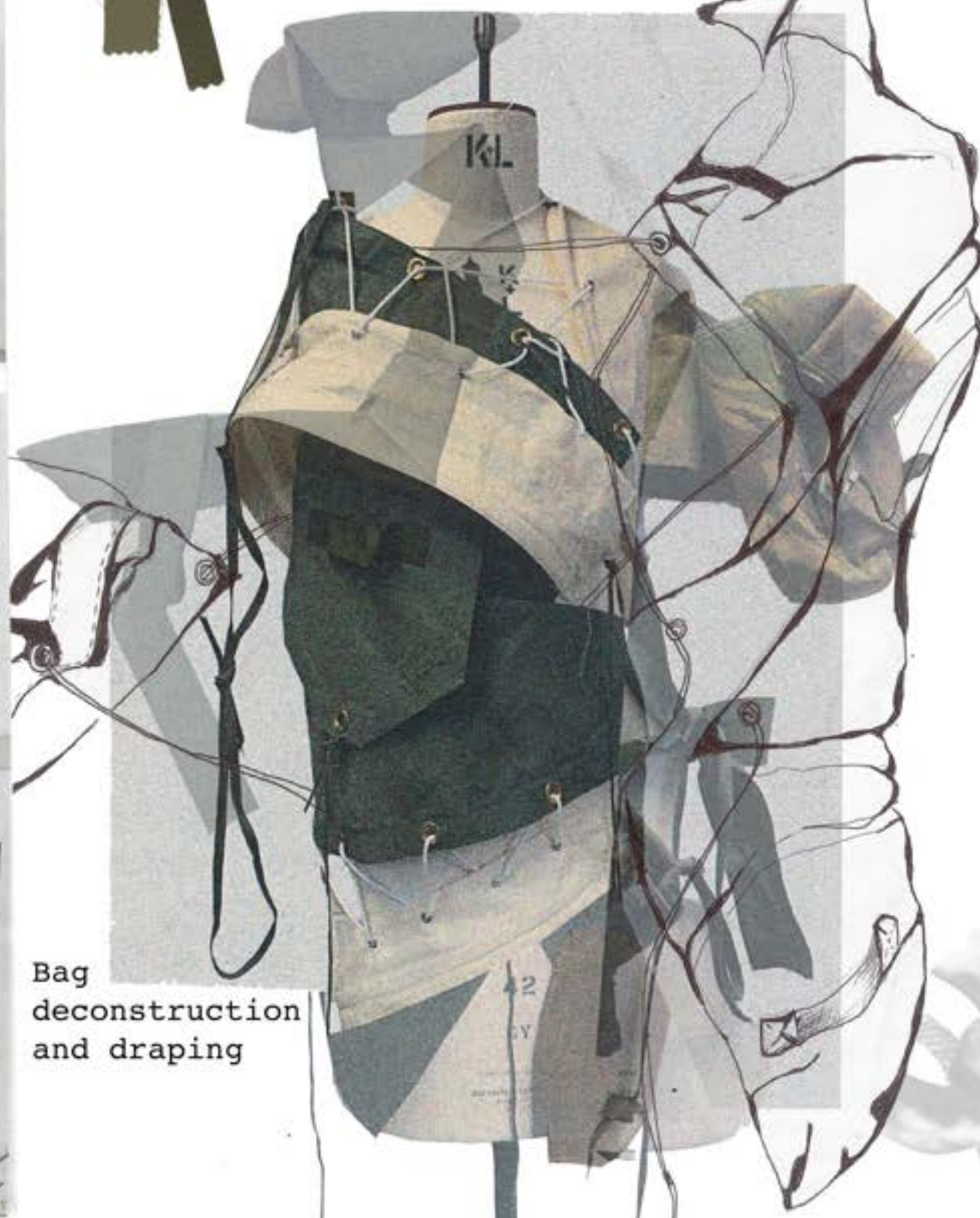
Bag deconstruction and draping