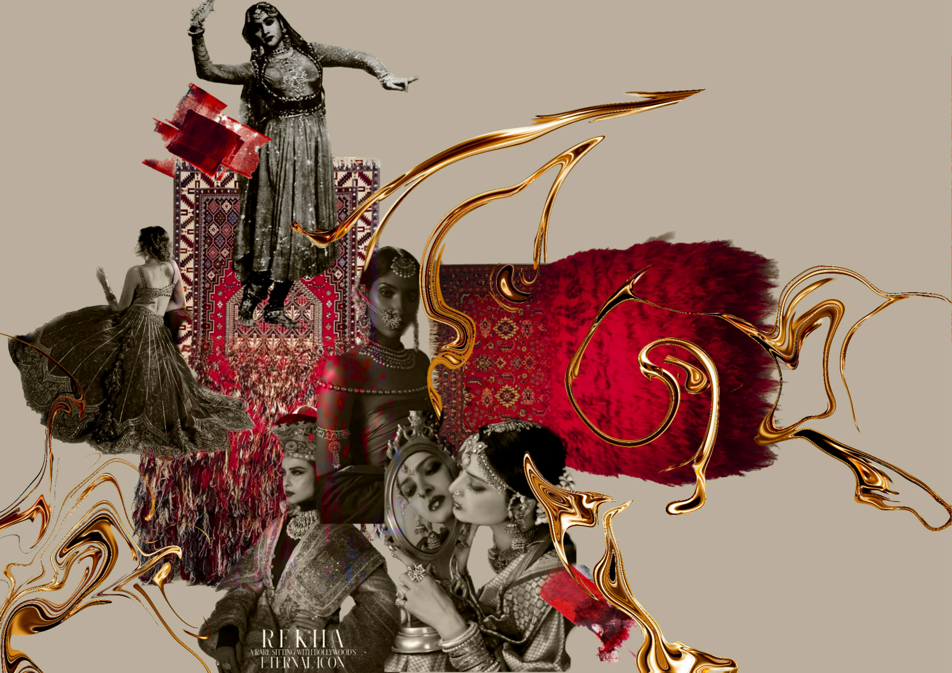
REKHA A RARE SITTING WITH BOLLYWOOD'S ETERNAL ICON