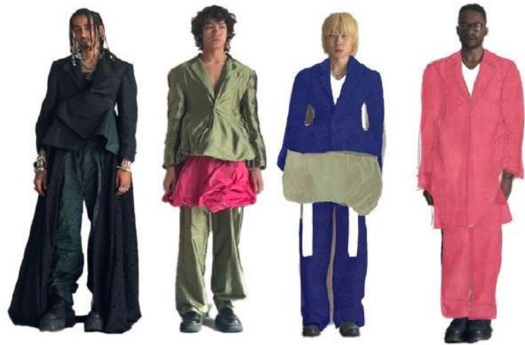
Dressed Like THAT