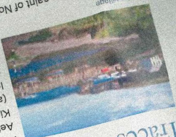
St Abb's village

Traces of our past Aebbe, daughter of Aethelfrith, the first King of Northumbria (at that time all the land from the Humber to the Forth) was abbess of a monastery on Kirk Hill from 643 to her death around 680. Cuthbert, the patron saint of Northumbria, was a visitor to the monastery, spending contemplative nights immersed in the sea. After Aebbe's death, the monastery was accidentally burned down and never replaced. Very slight traces of it can still be seen. Aebbe was sainted for her name was later given to this headland and the neighbouring vil-